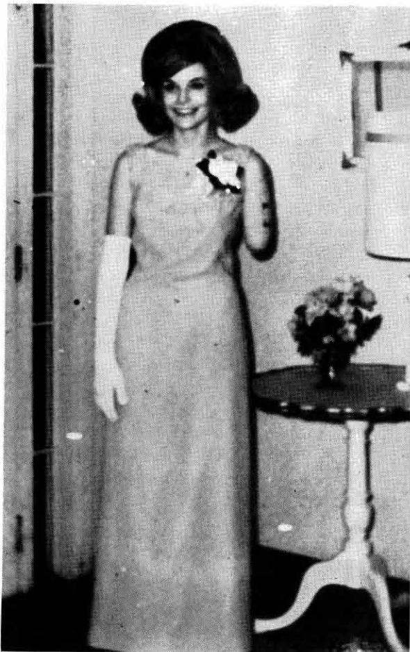
Fig 3—17-year-old girl with both hair loss and amputation. She made an excellent adjustment, with help from her family and boyfriend, and is shown with her wig, on the way to the Senior Prom.

The attitude of the parents may be reflected in the adolescent's attitude toward his illness—the well adjusted parents who are eager to aid the physician in the total care versus the frightened or overprotective parents. Pre-existing distrust between the patient and parents or other authority figures may manifest itself in rebellion and resistance to staff and therapy. In general the adolescent must realize his physician is honest, interested, available and willing to spend time talking and listening. We should find out what is "bugging" these patients the most. Often other symp-