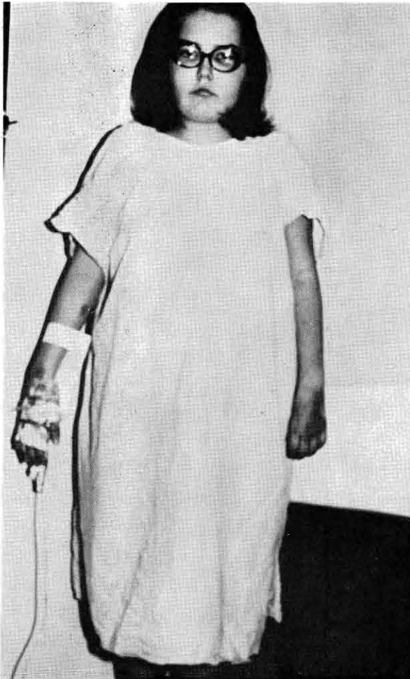
Fig 5—Prednisone therapy causing cushinoid appearance in girl with leukemia.

Death is a very personal matter and yet the patient must feel his physicians will not abandon him—will not let him suffer pain or isolation. Many want to be at home in familiar surroundings, and members of the staff visit them at home. Many have asked that their bodies be donated to science and feel that in some way they have contributed through their ordeal of