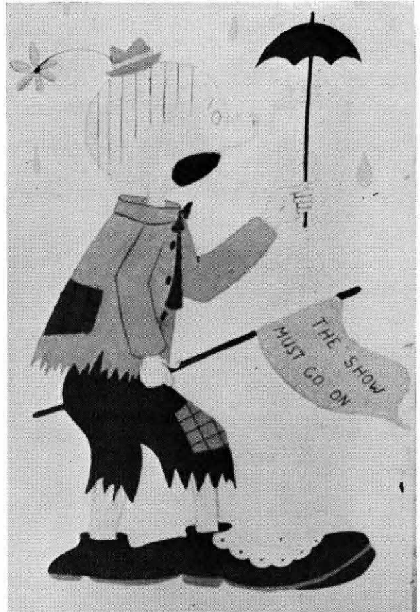
Fig 8—Drawing by a patient with Hodgkin's disease. Note the message on the flag; hope is important.

Fig 7—By a mother, this poem shows that parents also need emotional support.